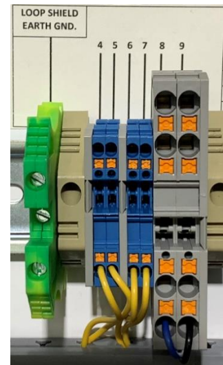
Right-Side Terminal Blocks Accepts 14-24 AWG Wire

*The +24V is only present while one of the vehicle detectors is currently detecting a vehicle