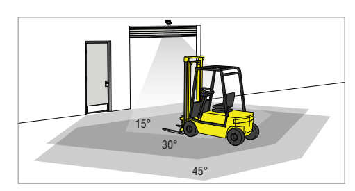
Scenario 1: Vehicle approaches: Vehicle-detection relay is activated. Door opens. Person-detection relay is not activated. Entrance for people remains locked.