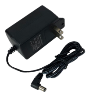
A/C Adapter Part Number: 39193A.S (Sold separately)