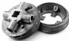
5.25" SPRING CONE SET